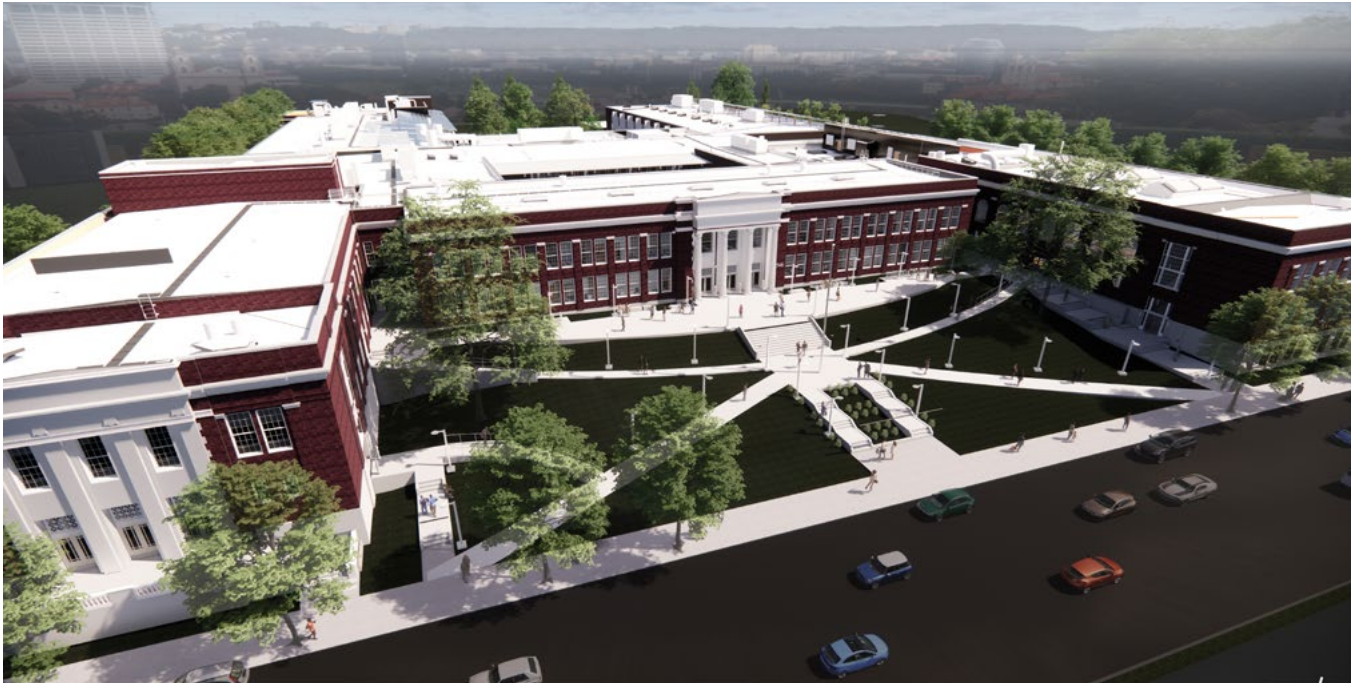
Above: Design visualization from October 2020 of planned renovations for Benson Tech's front entry from an aerial view. (Image courtesy of Bassetti Architects)