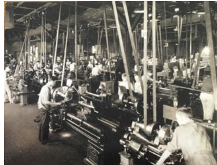
Above: Benson Tech machine shop, 1939.

What we now know as the Benson Polytechnic High School Alumni Scholarship Fund began in 1991 as a gift from the Classes of 1939, 1940, and 1941.