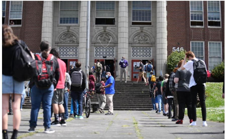
Above: Benson Tech students line up in front of the school to enter the building on April 19 for their first day of in-classroom instruction since the COVID-19 pandemic began last March. Students have the option to finish the 2020-2021 school year with a hybrid schedule that returns them to the classroom two days a week.