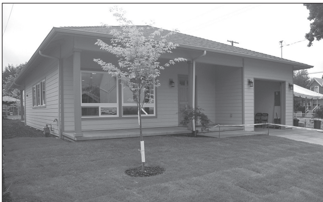
House built by Benson students completed in May 2012.

In May 2012 another Benson student-built house was finished and celebrated. That event, attended by representatives from the mayor's office and the school district, was covered by Portland's newspapers and KOIN Channel 6 television. The house sold two days after being listed and for more than