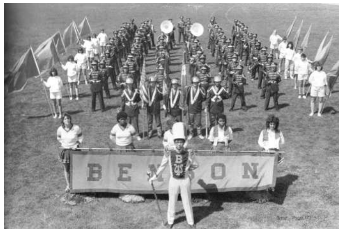
1983-84 School Band

If you have any interest please email the Association at info@BensonTechAlumni.org . After we have a few names a mutually convenient organizational meeting will be set. Once it is formed the "band" might determine its own activities and direction.